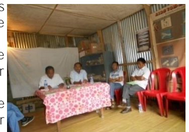
YMS Annual Board Meeting

Yingli Mission Society work on a people-centric model of development in areas of public health, education, women empowerment, community development and social welfare with dream, hope and vision for the future. The future where our needy friends are respected and cared for, the future where equal opportunity is given to all and a society with fullness for living our life.