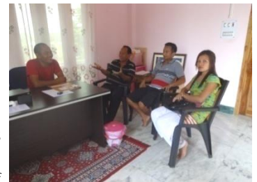
Chairman YMS with Director and Program Managers

The services provided by the TIs and linkages to other services are outreach & counseling, Needle Syringe exchange program, condom promotion, basic/STI services & abscess management, IEC, advocacy, referral to OST, DOT, ICTC, ART, Detox & Rehab centres, PLHA networks for home based care & support etc.