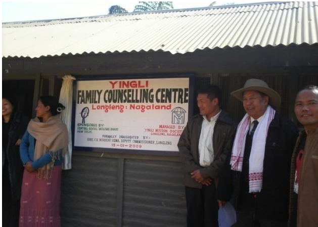
(Deputy Commissioner Longleng visiting YMS Family Counseling Centre)

YMS Family Counseling Centre, supported by Nagaland State Social Welfare Board, serves the maladjusted, disrupted and problem-ridden families from the surrounding rural areas. It focuses on assistance to women and children suffering from atrocities and stressful situations.