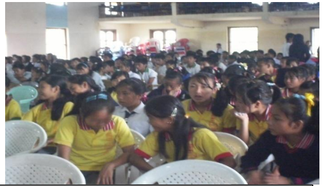
"Students can play a big role in creating cancer awareness in the northeast, where the number of cases is steadily on the rise. The event is aimed at motivating students to help their family members and neighbours abandon the habits that causes cancer,"

Cancer Awareness and Educational Programs were conducted at various places. A total of 915 participants benefited from these programs. During the programs, information was given about cancer, causes and symptoms of cancer, types of cancer, cancer check up and its importance, cancer treatment and prevention. During the program, pamphlets related to cancer were distributed among the participants to educate them about cancer. The program technical support was provided by the Doctors from Govt. Hospital Longleng.