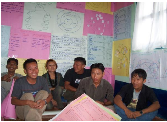
TI Staff on HRG mapping and site assessment.

(Map geographical and social overview of a site and help HRGs analyse the range of risk and vulnerability factors they experience that increase their susceptibility to HIV/STI transmission).